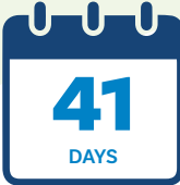
HOSPICE HOUSE AVERAGE LENGTH OF STAY