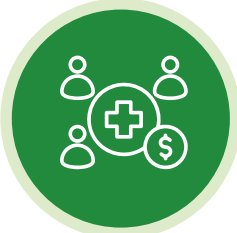
PALLIATIVE CARE VISITS