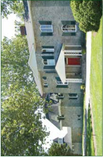
The Manor House at Londonderry 700 Port Street, Easton c. 1867

Situated on the Tred Avon River, the manor house at Londonderry was completed in 1867. The land known as "London Derry" was granted to Captain Francis Armstrong, a Quaker, by Lord Baltimore in 1649. Armstrong sold three acres to Talbot County for the first court house at a cost of 115 pounds of tobacco.