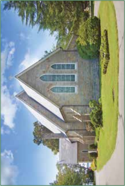
The Church of the Holy Trinity c. 1894 502 S. Morris Street, Oxford

of Talbot Hospice Foundation and currently serves as an Emeritus board member.