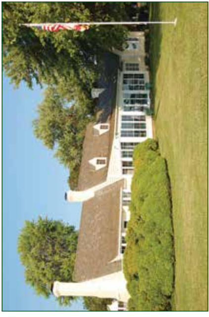
Thread Haven Cottage 100 West Street, Oxford c. 1946

In March of 2015, a lightning bolt set the roof on fire; causing water damage to the entire second floor and much of the first floor. Reconstruction progressed slowly due to the historical nature of the home and the owner wished to retain the original interior. Care was taken as a new roof was installed, floors refinished, and walls painted to