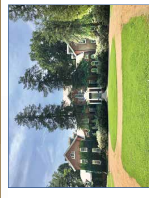
25918 Voit Road, Easton Hope House

Hone House one of the great mansions of Talhot