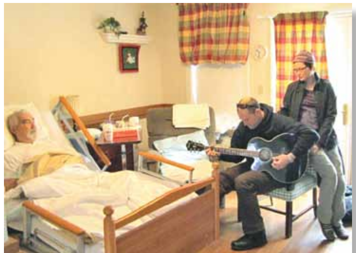
A grandson plays melodic acoustic guitar to his grandfather in the Guest Wing of Hospice House. Winter 2011