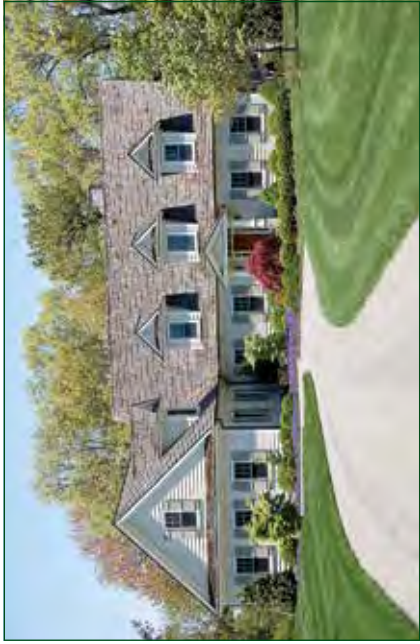
Cosey View 8348 Ingleton Road, Easton c. 2008