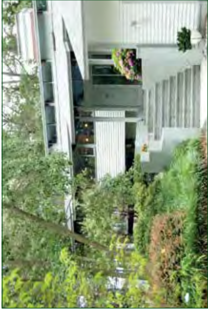
Residence of Paul Turczynski and James Gordon 5837 Irish Creek Road, Royal Oak c. 1988

There are four bedrooms including two master suites, one on each floor, three full bathrooms and a powder room. a marvelous bonus room